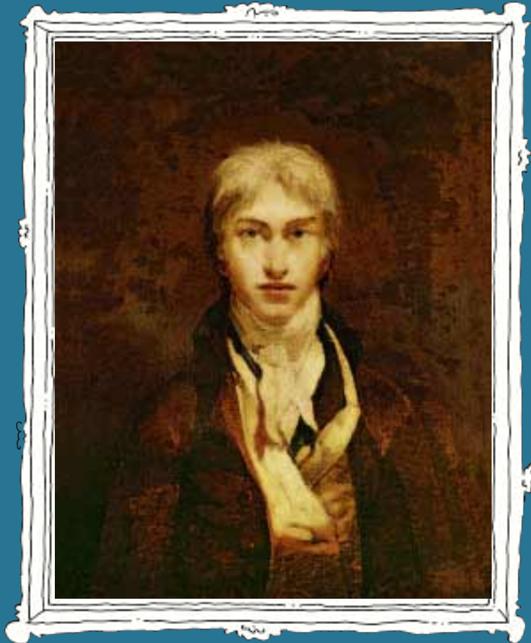
This is how Turner painted himself at the age of twenty-three.

Despite this, Turner was appointed professor at the Royal Academy in London and he earned so much money that he was able to build his own gallery. Turner also became a great example for many later artists.